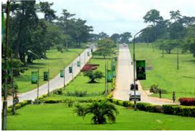
Figure 1.1: Road 1: Entrance to the University

Academic Part Advisers or The Head of Department. The information provided by the Head of Department, or any person acting on behalf of the Head of Department, takes precedence over the information provided in this handbook. As much as possible, we have tried to make information in this document as accurate as possible. The University's Programmes Handbook contains all the necessary details in respect of the programmes offered by various Faculties and Departments. You are also strongly advised to consult the most recent official rules and regulations before completing registration and other forms or processes. In case of any conflict or doubt please do contact your Academic Part Adviser.