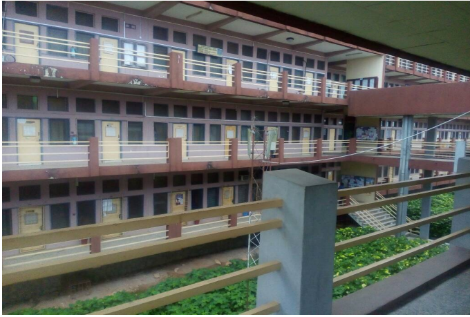
Figure 2.1: Section of the Computer Buildings