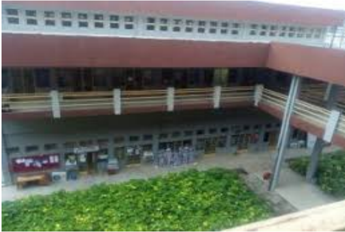
Figure 2.2: Section of the Computer Buildings